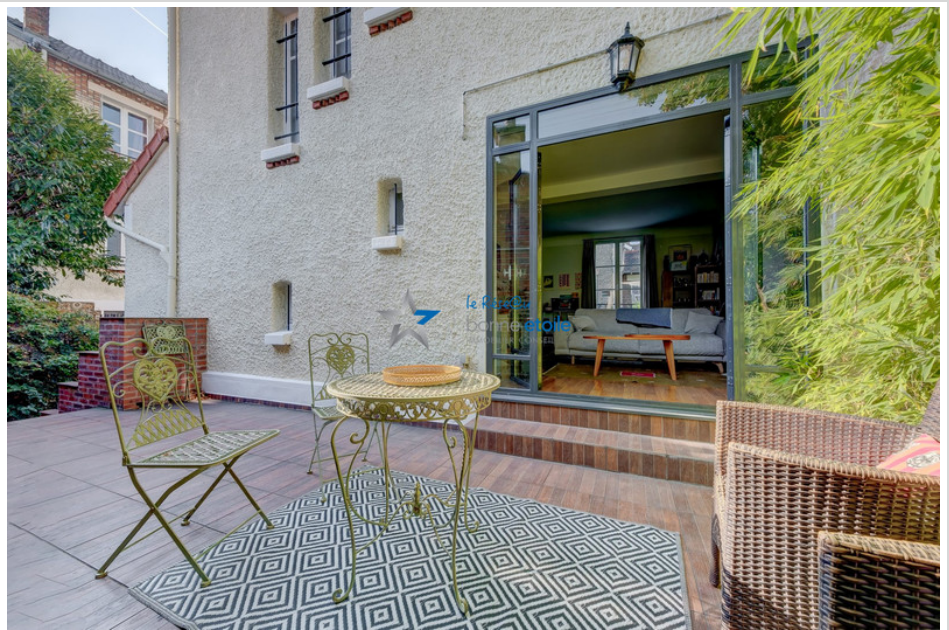
House 6505 Paris