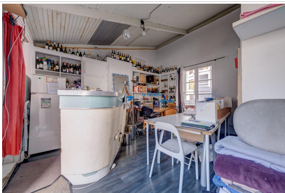
Maison ancienne 6436 Paris