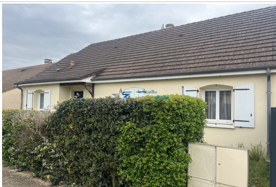
House 6579 Changé