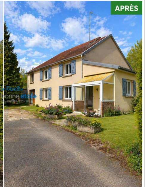
House 6586 Chalindrey

Energy class (dpe) : G - Emission of greenhouse gases (ges) : G Document non contractuel - 13/06/2026