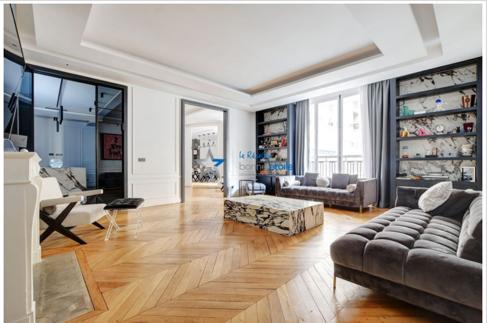
Appartement 6559 Paris