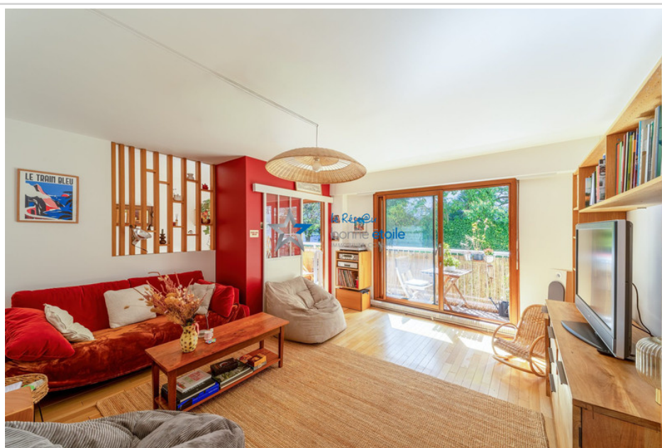
Appartement 6583 Paris