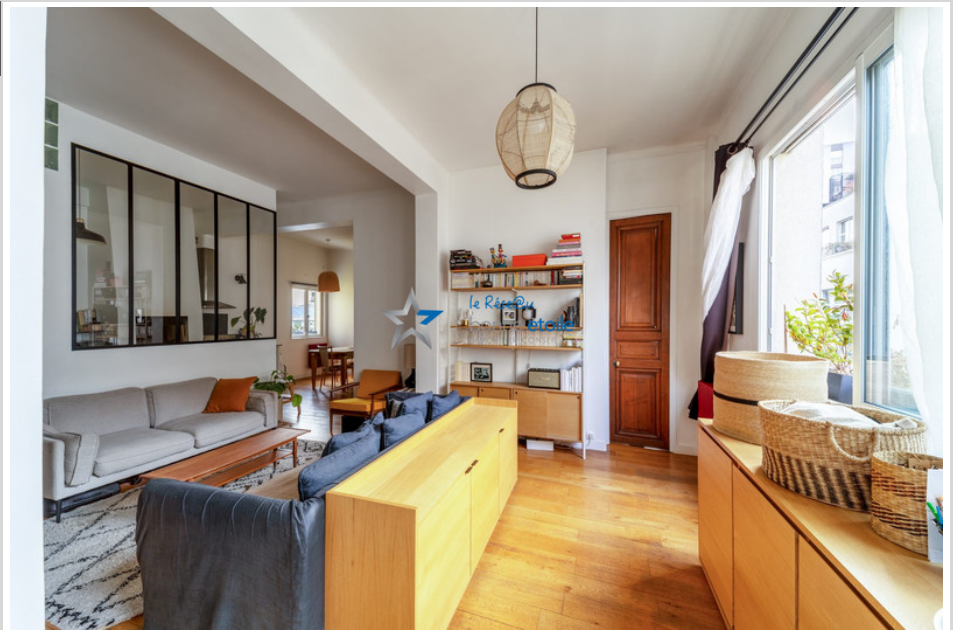
Appartement 6550 Paris