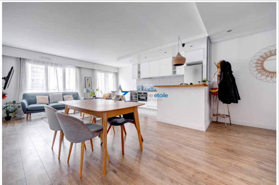
Appartement 6535 Paris