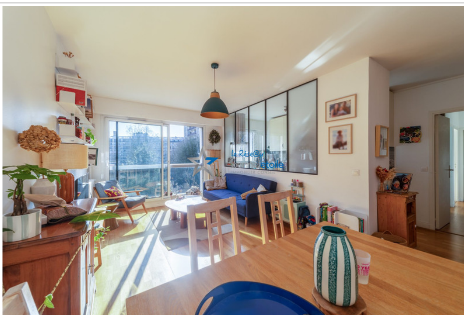
Appartement 6557 Paris