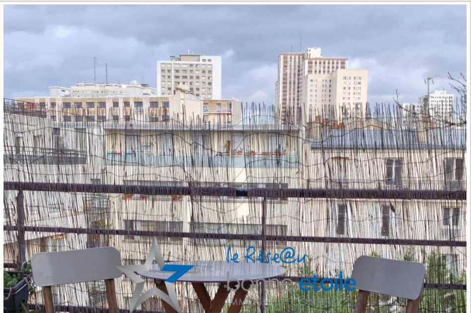
Appartement 6554 Paris