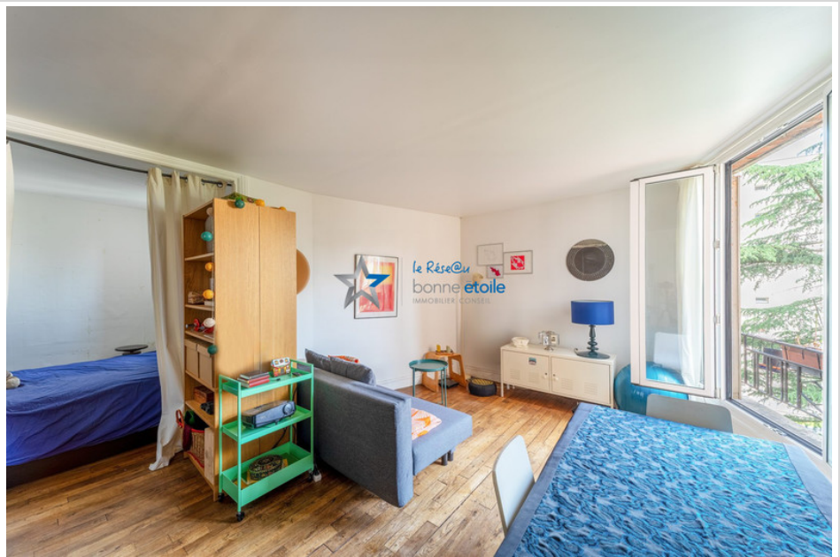
Apartment 6620 Paris