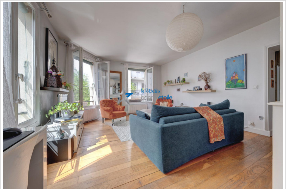
Apartment 6601 Paris