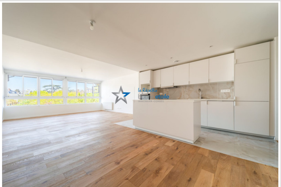
Apartment 6396 Chatou