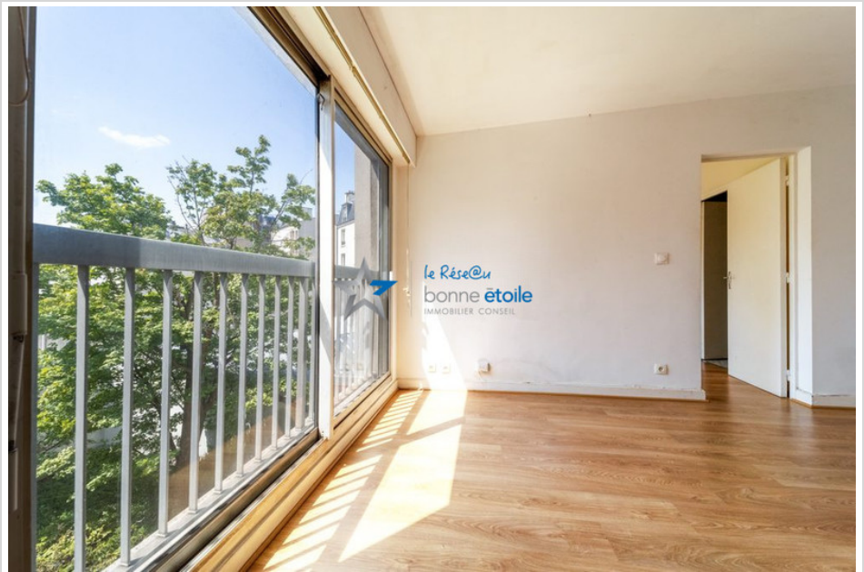
Apartment 6470 Paris