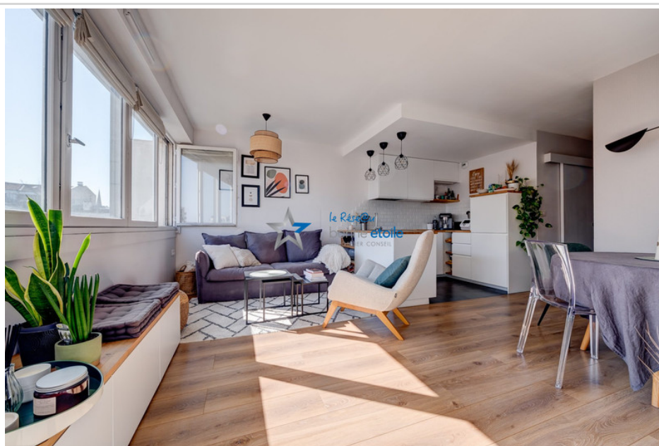
Apartment 6424 Paris